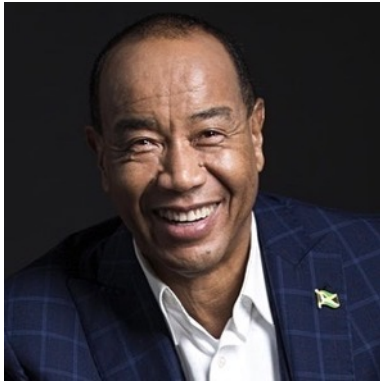
Michael Lee-Chin Chief Executive Officer